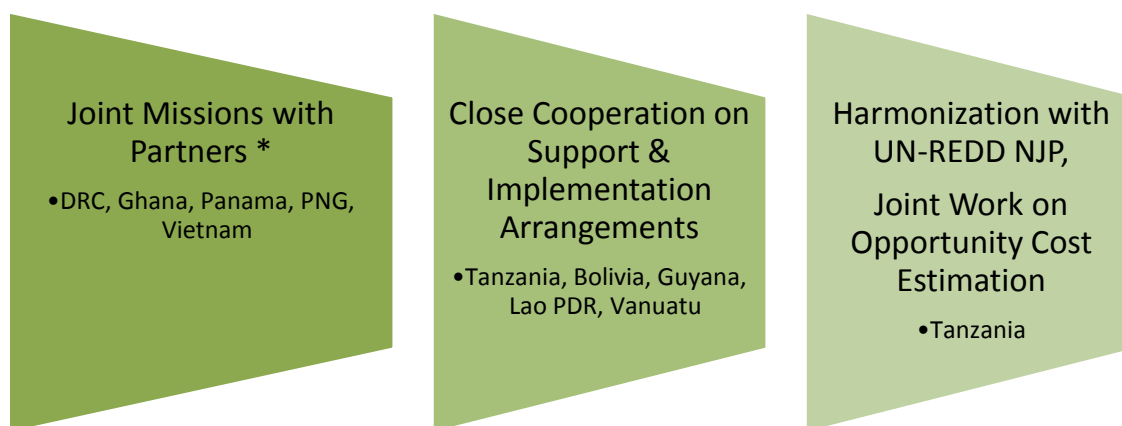
Figure 4: Coordination with REDD Partners in FCPF REDD Countries

*Partners: Agence Française de Développement (AFD), AusAid, Denmark, Finland, GEF, International Union for Conservation of Nature (IUCN), Japan, KfW Bankengruppe (KfW), Moore Foundation, the Netherlands, Norway, UNDP, UN-REDD, civil society, etc.