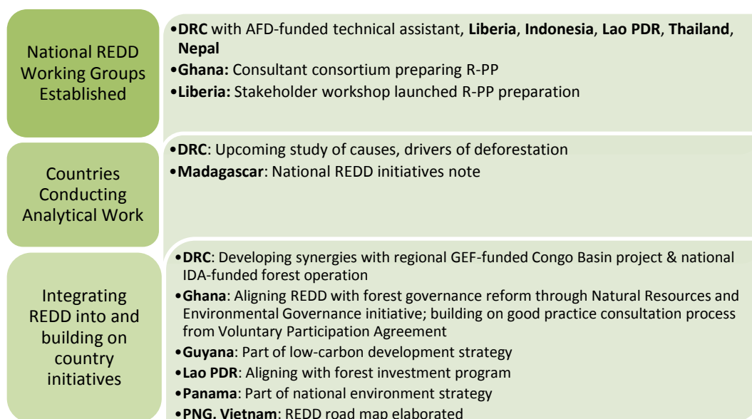
Figure 3: Examples of Country Analysis and Preparation for REDD

Toward the end of the fiscal year, several REDD Country Participants began to shift focus from the initial R-PIN to the more detailed R-PP. While progress on R-PPs (formerly called “R-Plans”) was slower than originally anticipated, the PC put considerable effort from March through June 2009 into discussing and clarifying the elements and criteria for a well-prepared R-PP. Three pioneering countries – Guyana, Indonesia, and Panama – submitted R-PPs, and subsequently received comments and assistance to help them advance their REDD readiness work programs. These reviews, along with consultations with a broad range of government, private sector, NGO and indigenous representatives, stimulated significant revisions.